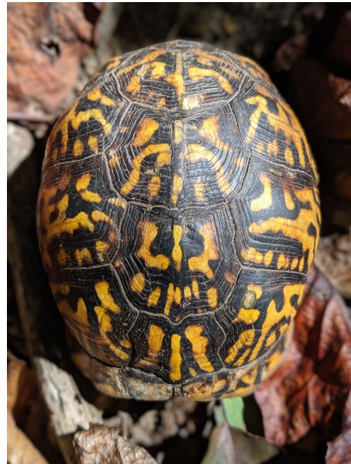
A box turtle in its shell