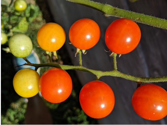
Multicolored tomatoes from my grandpa's garden