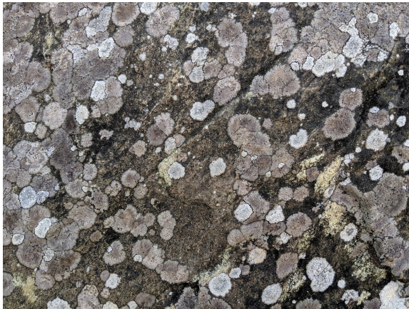
Spots on a rock on a mountain