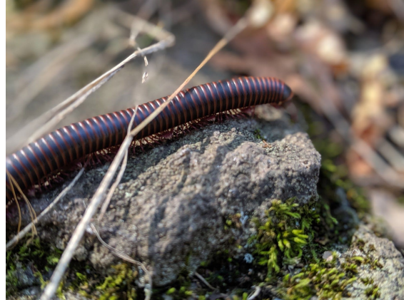
A millipede on a rock