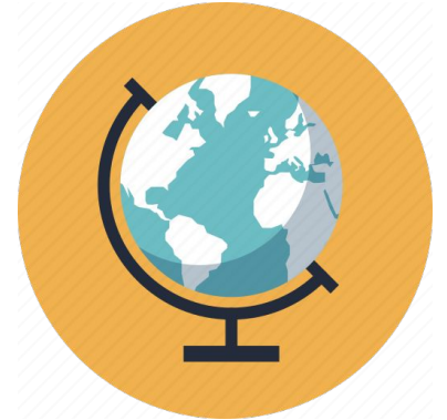
G/T Social Studies