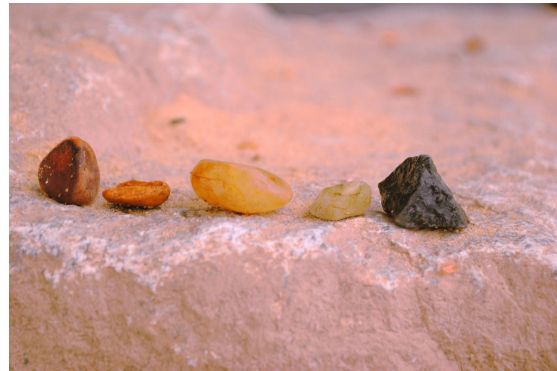
#2: Just Chillin