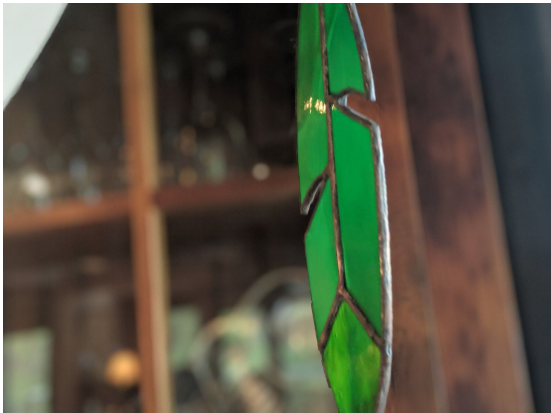
#3: [No Name]