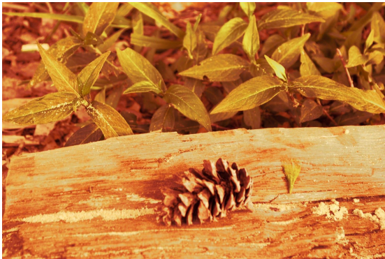
#1: Gold Sunrise